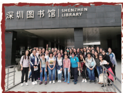
Looking forward to our mid-day visit!

The Library Society visited the Reading Mi Bookstore and Shenzhen Library with the Chinese Society. We, as book lovers, had spotted our favorites and, as students, had our horizons broadened.