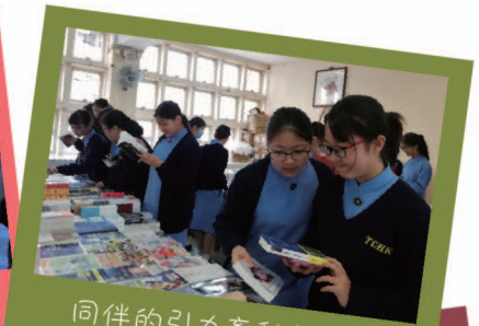
同伴的引力牽動著人心