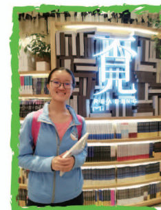
"It is only through the heart that one can see rightly, what is essential is invisible to the eye." - The Little Prince