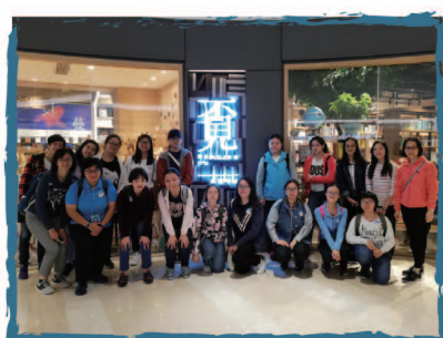
Looking gorgeous at Reading Mi after a 2-hour coach ride!