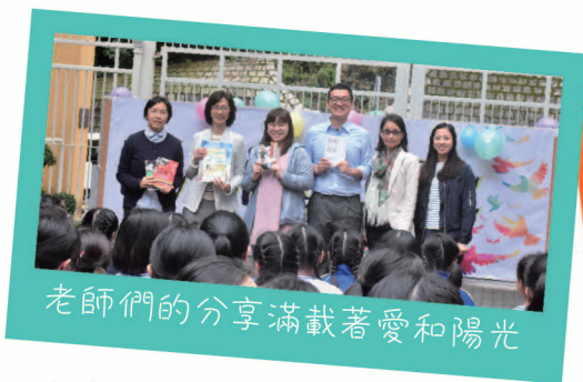
老師們的分享滿載著愛和陽光